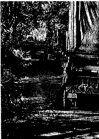
Knechts Bridge Road